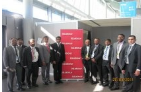
Tamils for Labour fringe event at the Labor Party Conference on Wednesday 28th September

pressing need" to deal with this issue and voiced his concern that the United Nations Human Rights Council had not acted more promptly. "Frankly I